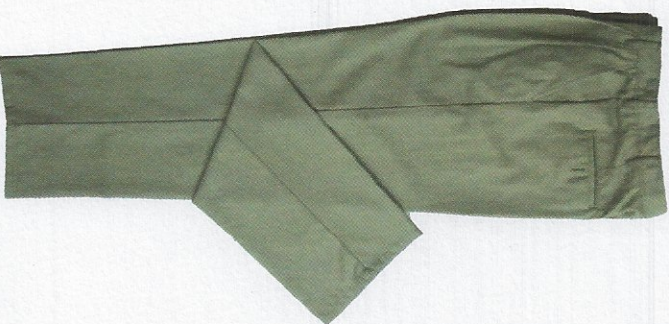
150 GSM (4.5 Oz) NOMEX COMFORT Trousers Sizes – 28, 30, 32, 34, 36, 38