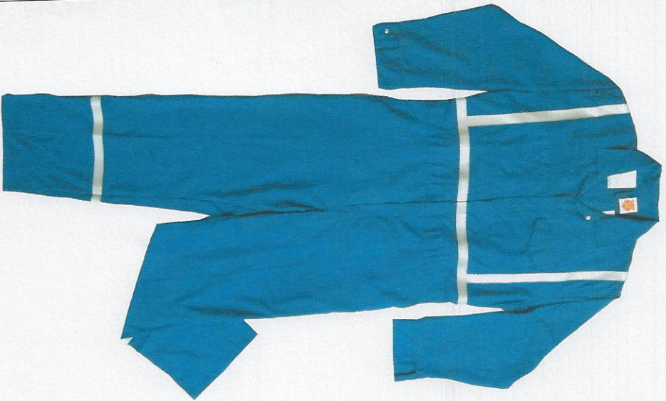
150 GSM (4.5 Oz) NOMEX COMFORT Coverall, Sizes – S, M, L, XL, 2XL, 3XL, 4XL