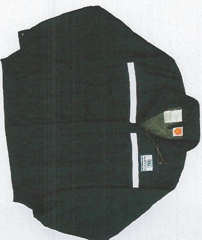
3 Layer NOMEX COMFORT Winter Jacket Sizes – S, M, L, XL, 2XL, 3XL

Approvals – EN11612 (EN531 A,B1,C1), EN1149-1, EN340